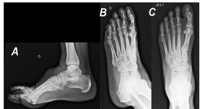
Fig 1: Right foot radiographs in lateral (A), oblique (B) and posteroanterior (C) views without alterations.

Procedure occurred after 3 months of evolution of the condition. During surgery, the tumor was found to surround the long extensor of the hallux, superficially to the extensor tendons of the toes, and it was resected, preserving the anatomy of the foot. Anatomopathological examination of the surgical specimen showed ectatic vessel with organizing thrombosis and intravascular papillary endothelial hyperplasia, compatible with Masson's tumor. The patient evolved well in the postoperative period. Six months after resection, there were no signs of tumor recurrence.